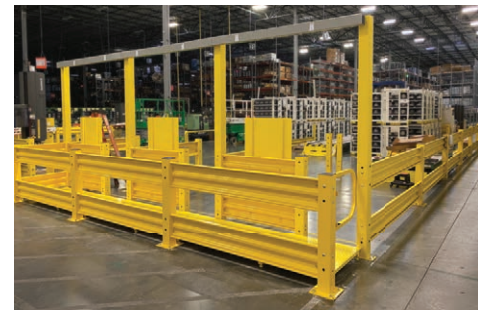
Guard Rail + Wire Partitions